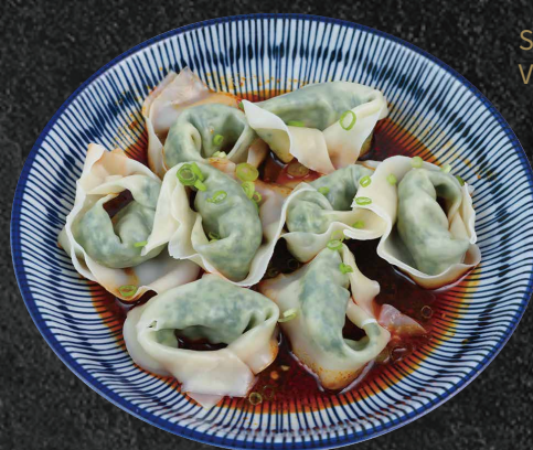
Szechuan Spicy Vegetarian Wonton