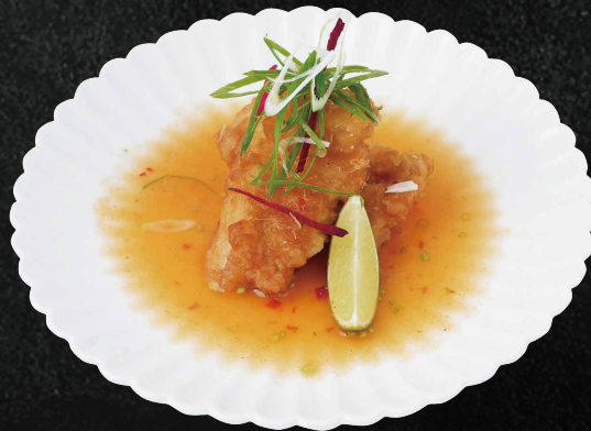
Lemon Fish Fillet