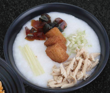
Guan Dong Congee