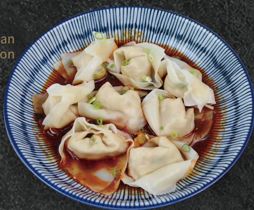
Szechuan Chicken Wonton