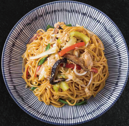
House Special Noodles

Cantonese style noodles with egg and vegetables.