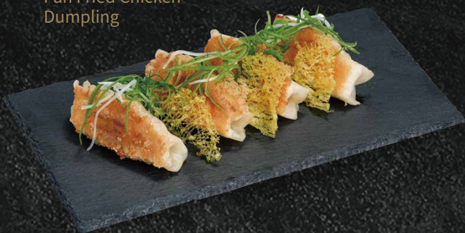
Pan Fried Chicken Dumpling

616 SHRIMP & ZUCCHINI SOUP DUMPLING (3PCS)