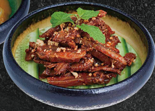
Szechuan Beef Tripe