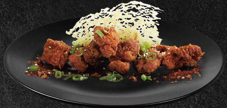
Xiang Xiang Umami Chicken