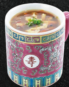
Hot & sour soup

Enriched beef broth with braised beef chunks.