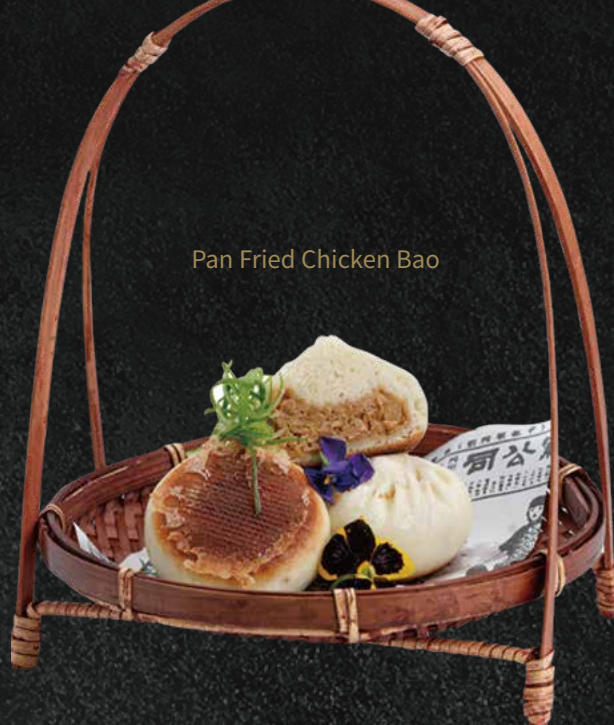
Pan Fried Chicken Bao