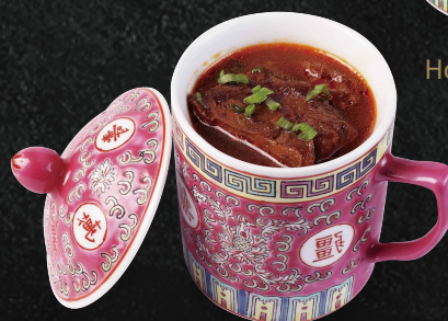
Braised Beef Soup