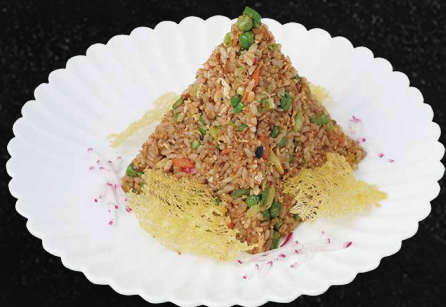
Asian Fried Rice