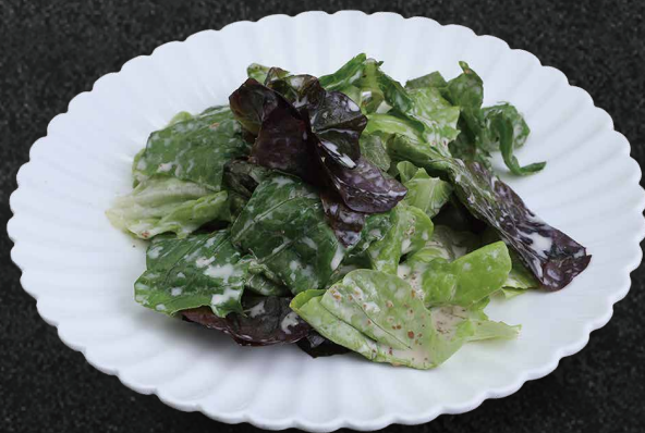
Assorted Lettuce Salad