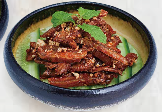
Szechuan Beef Tripe