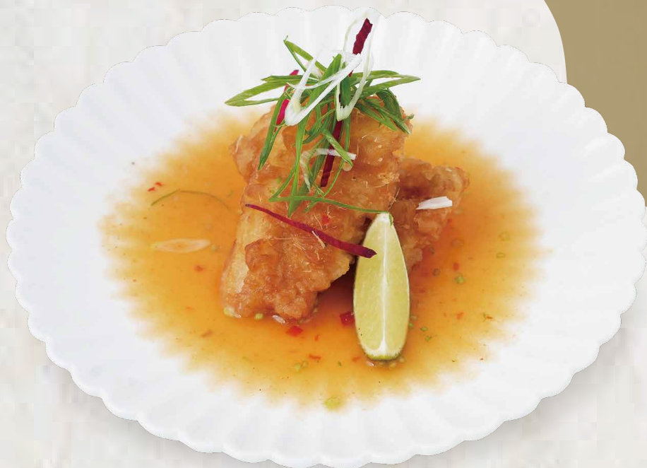
Lemon Fish Fillet