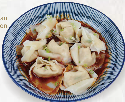
Szechuan Chicken Wonton

Boiled wonton flavored with minced chicken and Szechuan sauce.