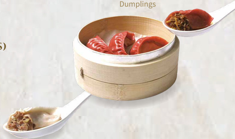
Chicken Soup Dumpling