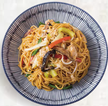
House Special Noodles

Cantonese style noodles with egg and vegetables.