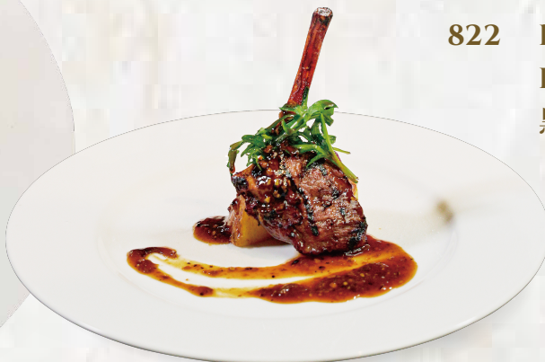
Black Pepper Lamb Chops