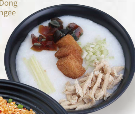
Guan Dong Congee