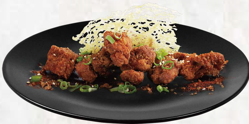
Xiang Xiang Umami Chicken