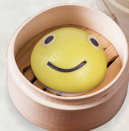
Smiley Lamb Bao