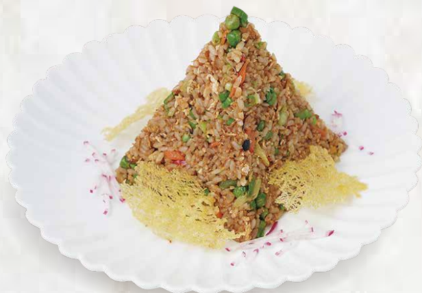
Asian Fried Rice