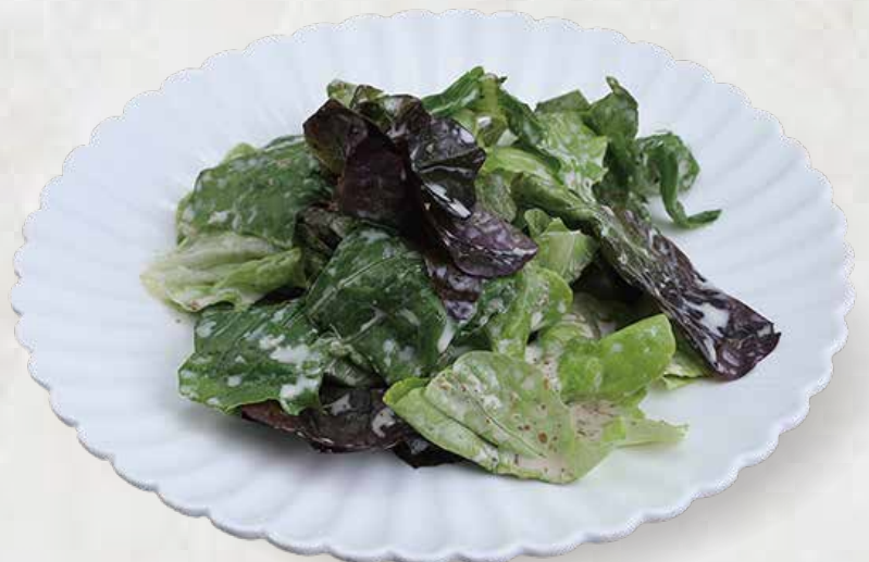
Assorted Lettuce Salad

Thinly sliced Tri tripe made flavorful with our unique Szechuan Sauce.