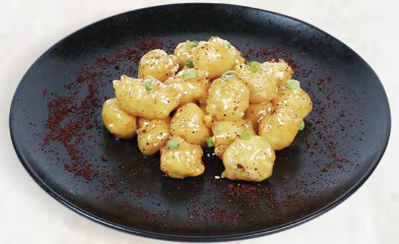
Mango Citrus Chicken