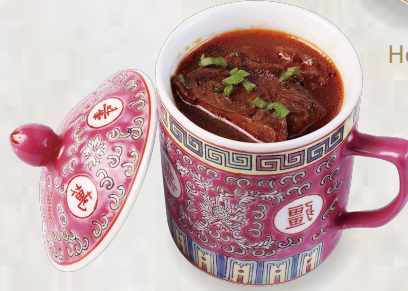
Braised Beef Soup

Enriched beef broth with braised beef chunks.