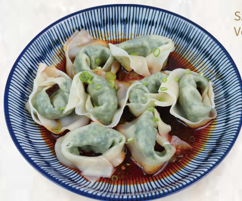
Szechuan Spicy Vegetarian Wonton