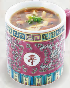
Hot & sour soup