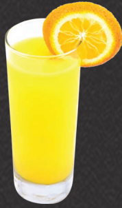
ORANGE JUICE /26