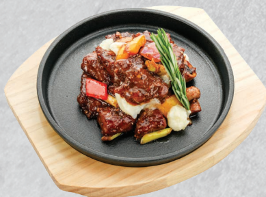
黑椒肋眼 WOK FRY RIB EYE /61