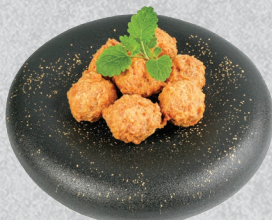
乾炸丸子 SHANDONG MEATBALL /24