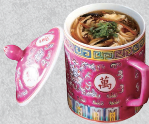
酸辣湯 HOT & SOUR SOUP /28