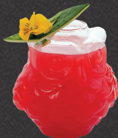
FRESH AND CLEAN /28