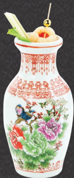
FUN SHUI /28