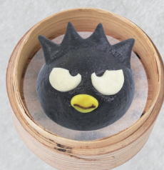
XO仔·牛肉包 BADTZ MARU / 8 BAO