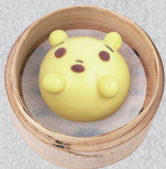
維尼·白巧克力 POOH BAO / 8