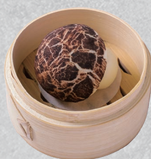
仿真花菇包 TRUFFLE MUSHROOM BAO / 8