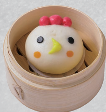
造型雞肉包 CHICKEN BAO / 8