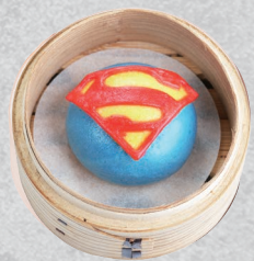
超人包 SUPERMAN / 8