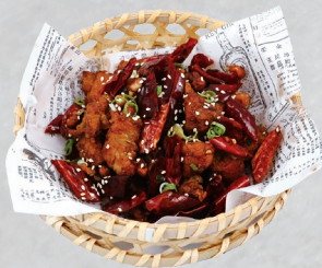
乾香辣子雞 CHILI HILL CHICKEN /39