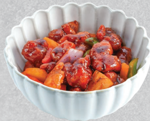
糖醋雞丁 SWEET & SOUR /36 CHICKEN