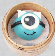
藍蘇利·海鮮包 SULLY BAO / 8