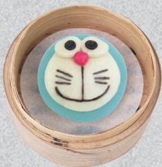
小叮嚀·蛋黃流沙包 DORAEMON / 8 BAO