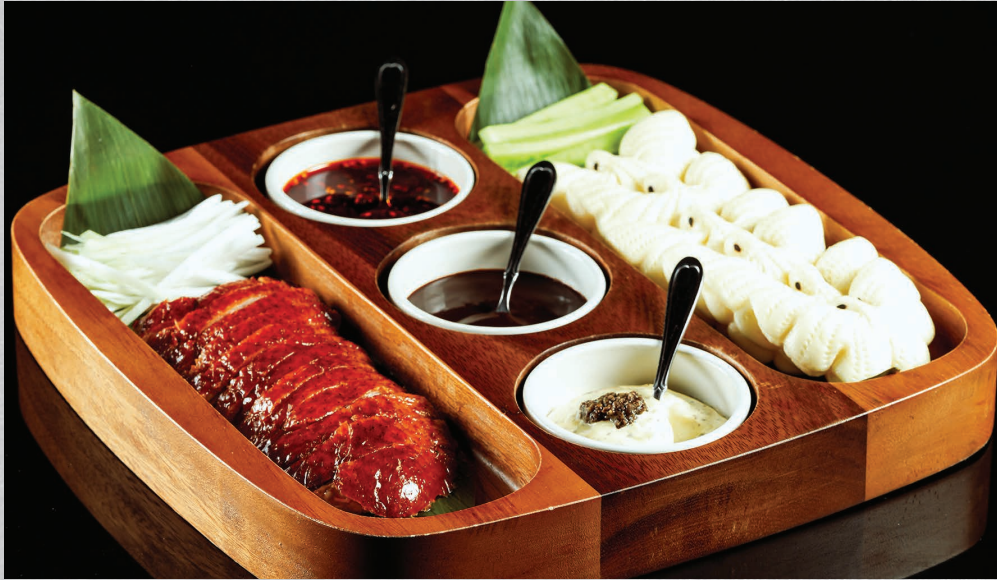
北京烤鴨 PEKING DUCK /135