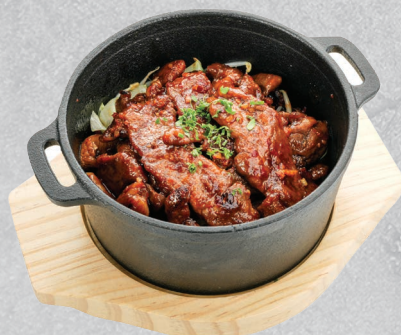
蒙古煎肋眼 MONGOLIAN WOK /57 FRY RIB EYE