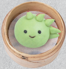
綠恐龍·豆沙包 DINOSAUR BAO / 8