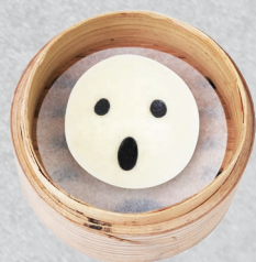
鬼怪·草莓流沙包 GHOST BAO / 8