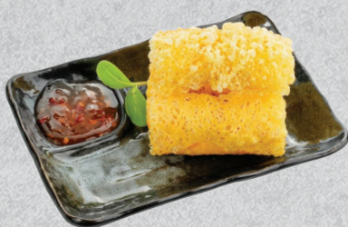
脆皮海鮮卷 FRIED SEAFOOD ROLL /27