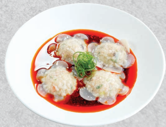
蝦仁抄手 SZECHUAN SPICY /36 PRAWNS WONTON