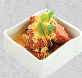
炒XO醬蘿蔔糕 STIR FRY RADISH CAKE /20 WITH XO SAUCE