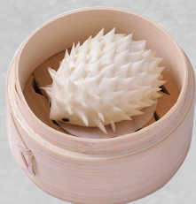
刺蝟叉燒包 PORCUPINE / 8