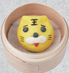
老虎·波霸奶茶包 TIGER BAO / 8