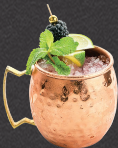
THE RASCALS /28