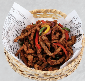
乾煸牛肉絲 CRISPY BEEF /45