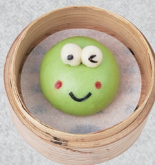
可洛比金莎包 KERO KEROPI / 8 BAO