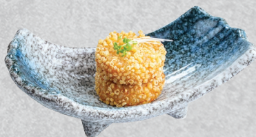
炸蝦蘿蔔糕 CRISPY SHRIMP /20 RICECAKE