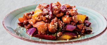
宮保雞丁 KUNG PAO CHICKEN /33