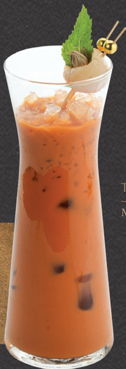
THAI MILK TEA /24