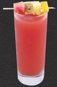
MIXED SEASONAL FRESH JUICE /26