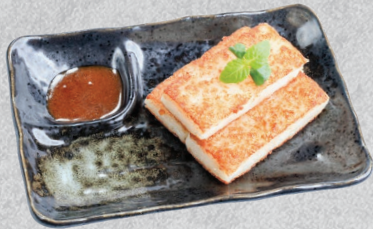
煎蘿蔔糕 PAN FRY RADISH CAKE /15