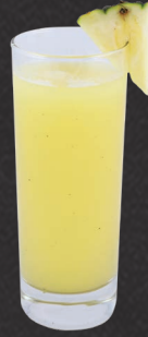
PINEAPPLE JUICE /26