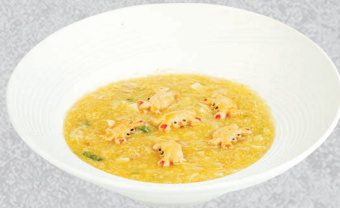
宋嫂鱸魚羹 CRAB ROE CHOWDER /28 SOUP