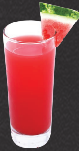
WATERMELON JUICE /26