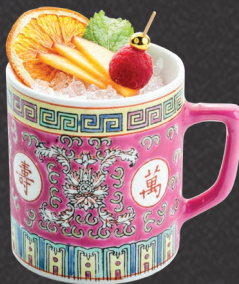
SWEET AND SOUR /28