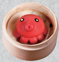
章魚哥甜地瓜包 OCTOPUS BAO / 8