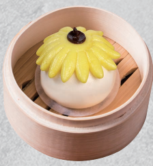
葵花芋頭 SUNFLOWER / 8 BAO