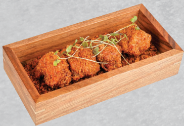
麻香雞 CHICKEN WOW WOW /34