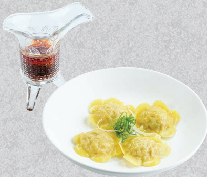
雞肉抄手 SZECHUAN SPICY /24 CHICKEN WONTON