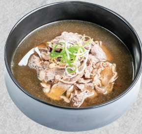
肋眼洋蔥湯 RIB EYE ONION SOUP /31