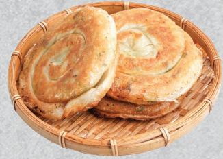
餡餅 MEAT PIE (PER PIECE) /15