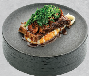
台朔牛短肋 BRAISED SHORT RIBS /67