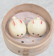
戀人兔子包 LOVE BUNNIES / 16 BAO